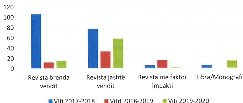
Botimet shkencore 2017-2020